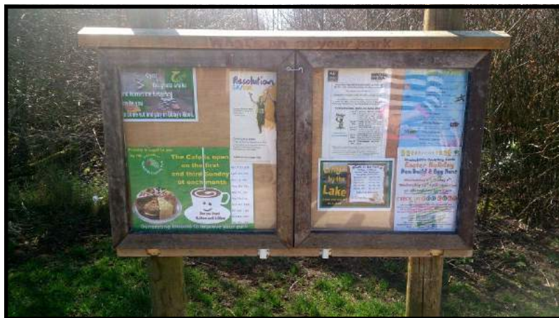
A refurbished noticeboard

The popular 'Hit Pipes' have been repainted and the bat refurbished.