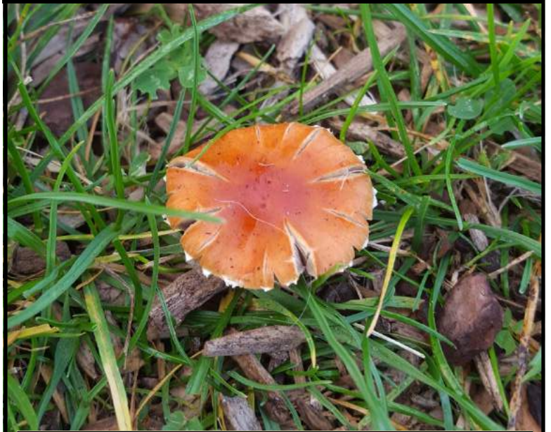
Some of the natural beauty of the park over the past months shown in photos from friends and Rangers - coloured winter dogwood displays, snowdrops in flower in the woodland, Ear fungus on a dead elder, alder catkins and flowers, wild cherry bark, and a pretty toadstool!